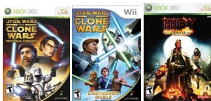
Star Wars : Republic Heroes Star Wars :Lightsaber Duels Hellboy :The Science of Evil