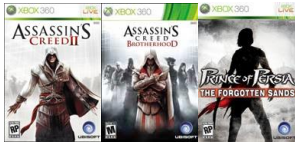
Assassins Creed : Brotherhood Prince of Persia Assassins Creed 2