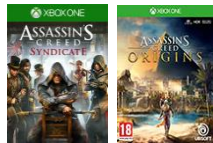
Assassins Creed Syndicate